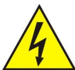
High Voltage Danger